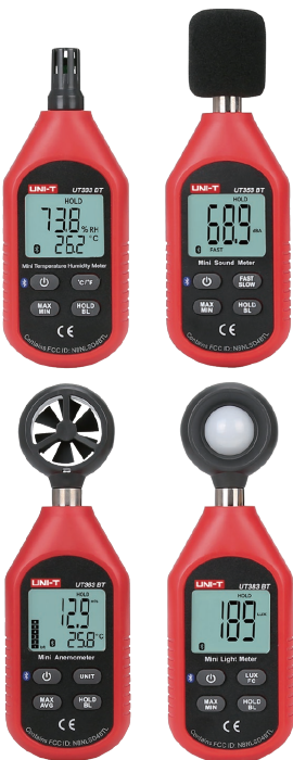
Mini Environmental BT Series