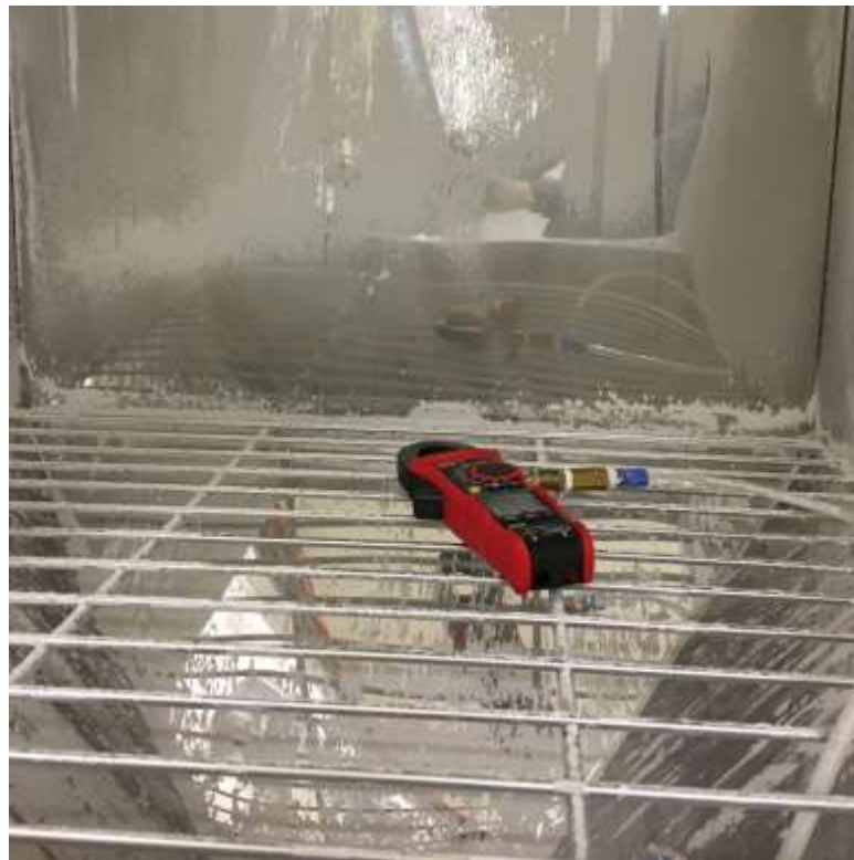
Figure 1: IP5X test