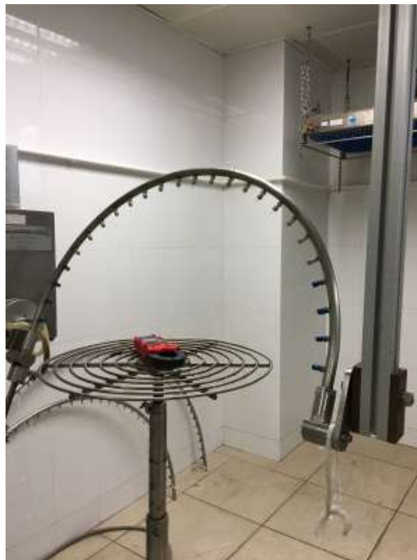
Figure 2: IPX4 test